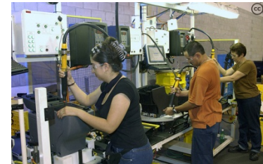
Electronic Torque monitoring via DC Tools