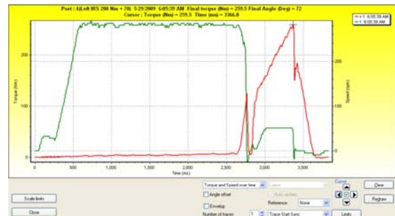
Improved Process – Torque & Speed vs Time

Similar results have been obtained in other joint fastening optimization studies.